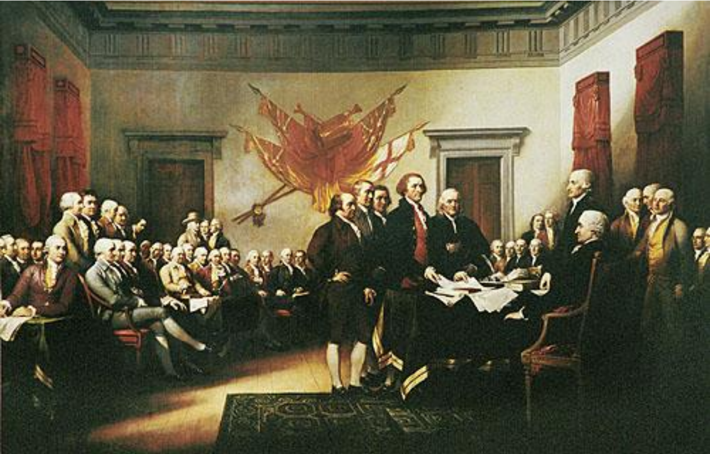
Commissioned 1817; purchased 1819; placed 1826 in the Rotunda