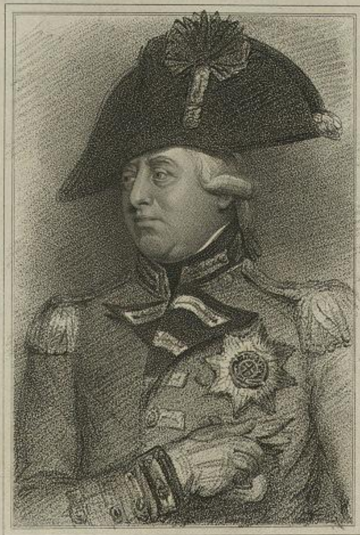
His Majesty GEORGE THE THIRD.